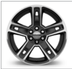
22-Inch Wheel – Silver Ultra Bright Machined w/Hi Gloss Black (SEW)