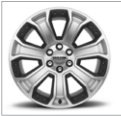
22-Inch Wheel – Silver w/Black Inserts (RX1)

Five Accessory wheels in high-quality finishes allow your customers to create a new look for their Yukon/Yukon XL.