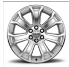
22-Inch Wheel – Silver (SF1)