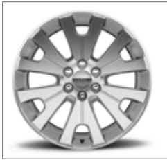
22-Inch Wheel – Silver Ultra Bright Machined (SFD)