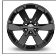
22-Inch Wheel – Hi Gloss Black (SEV)