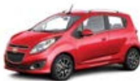
Salsa Red 2