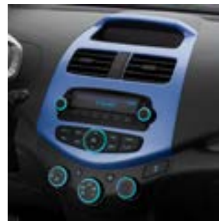
Denim Interior Trim Kit