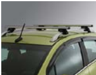
Roof Rack Cross Rails*