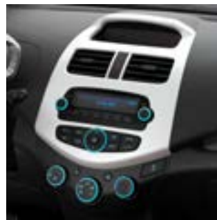
Summit White Interior Trim Kit