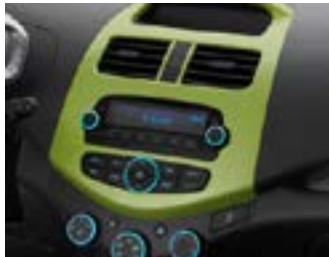
Interior Trim Kit*