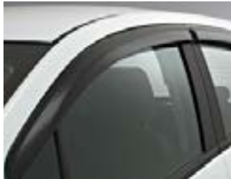
Side Window Weather Deflectors