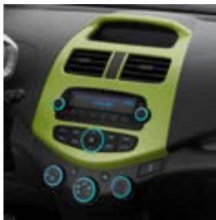
Jalapeno Interior Trim Kit