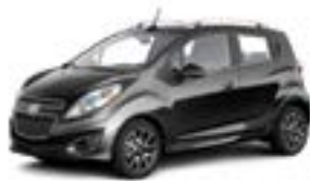
Black Granite 2,3