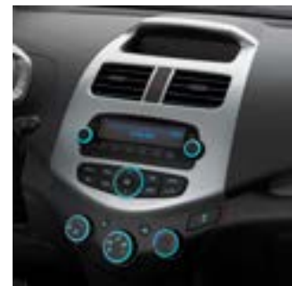
Silver Ice Interior Trim Kit