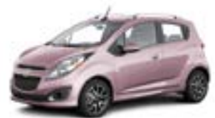
Techno Pink 2