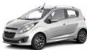
Silver Ice 2